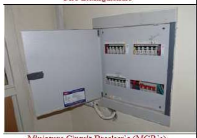
Miniature Circuit Breaker's (MCB's).