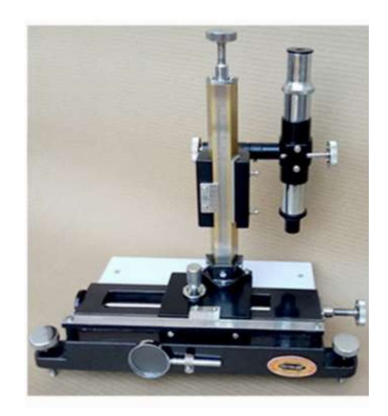
Fig: Travelling Microscope

A travelling microscope is an instrument for measuring length with a resolution typically in the order of 0.01mm. The precision is such that better-quality instruments have measuring scales made from Invar to avoid misreadings due to thermal effects. The instrument comprises a microscope mounted on two rails fixed to, or part of a very rigid bed. The position of the microscope can be varied coarsely by sliding along the rails, or finely by turning a screw. The eyepiece is fitted with fine cross-hairs to fix a precise position, which is then read off the vernier scale. The purpose of the microscope is to aim at reference marks with much higher accuracy than is possible using the naked eye. It is used in laboratories to measure the refractive index of flat specimens using the geometrical concepts of ray optics. It is also used to measure very short distances precisely, for example the diameter of a capillary tube. This mechanical instrument has now largely been superseded by electronic- and optically based measuring devices that are both very much more accurate and considerably cheaper to produce.