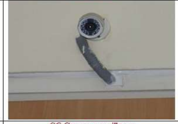
CC Camera surveillance