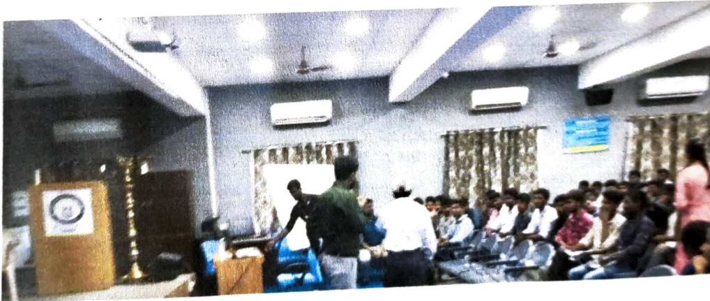
Photo taken during the session.